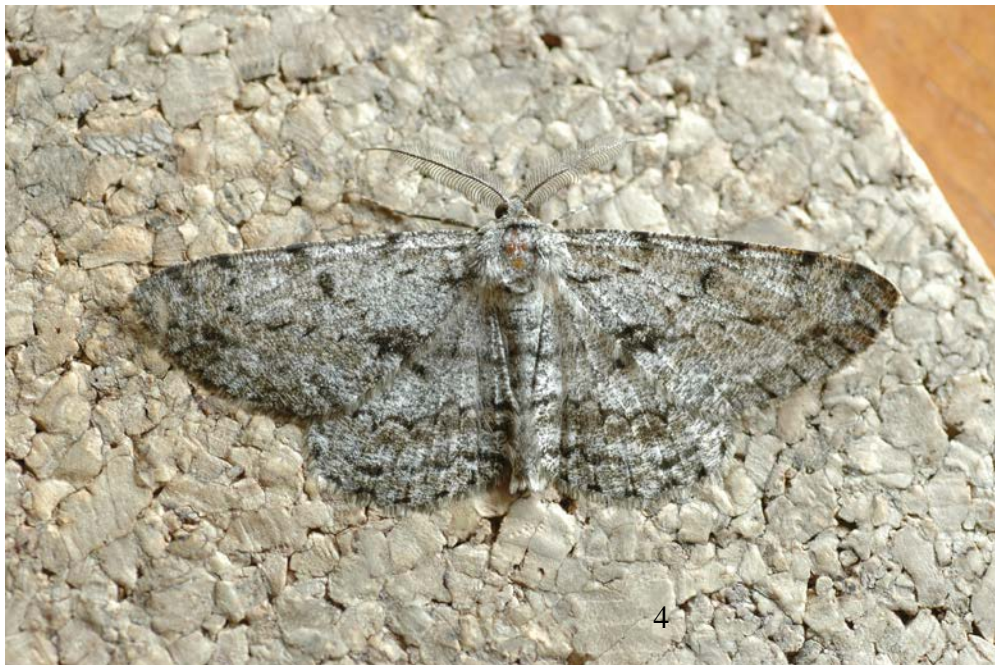
Great Oak Beauty