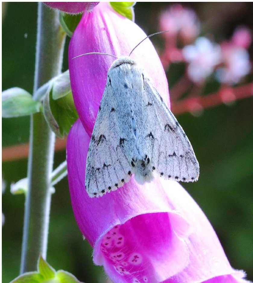
Miller moth ( Acronicta leporina )

The seventh successive month with above average temperatures, plenty of sunny days and muggy nights, interspersed by a few showery days, sometimes thundery, led to good numbers of both butterflies and moths. In addition to Double Line, already mentioned above, other species having an exceptional season include Beautiful Snout, Elephant Hawk and Miller moths. The main exceptions have been Common Blue butterfly, which is still depressingly uncommon this year, and to a lesser extent Marbled White which is also having a year of low numbers at many sites.