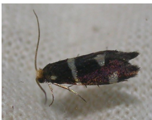
Incurvaria praelatella